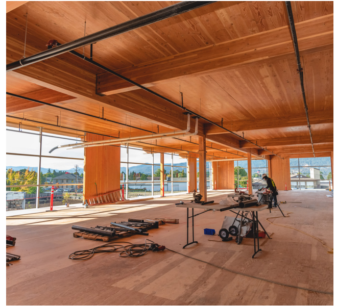
Rogue Primary School will be ready for students this winter!