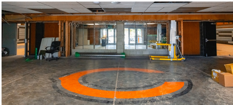
Gym lobby will receive updates, including new trophy case!

The CHS gym will be finalized and will reopen for student use in January 2023. The District is thankful for the community's support as we strive to provide safe and healthy facilities for generations of students to come.