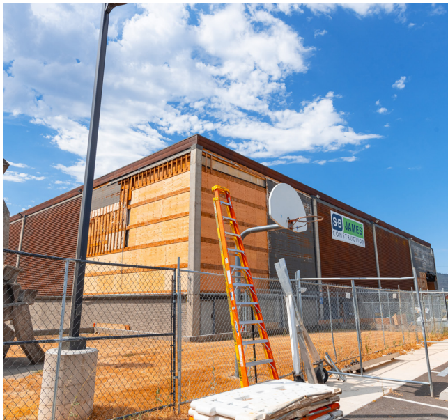
Crater High School's gym is getting a facelift with numerous seismic upgrades, updated facilities, and air conditioning!