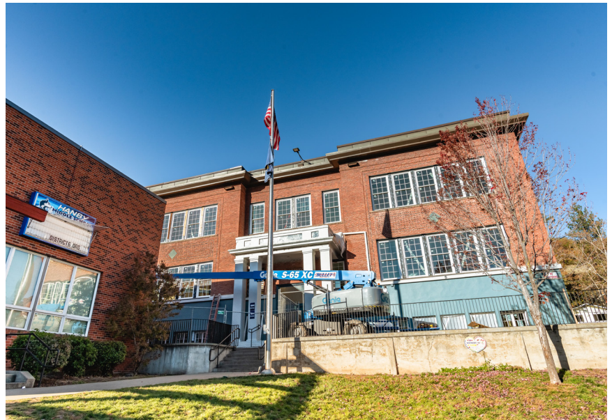
Hanby 1910 Building Remodel is nearing completion to reopen January 2023