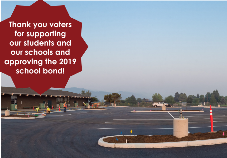
The Scenic Middle School parking lot remodel expands capacity and improves traffic flow.

Thank you voters for supporting our students and our schools and approving the 2019 school bond!