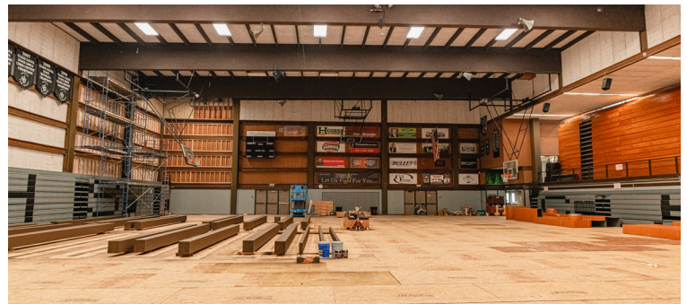
Shear walls to bolster seismic protection are being installed in the main gym.