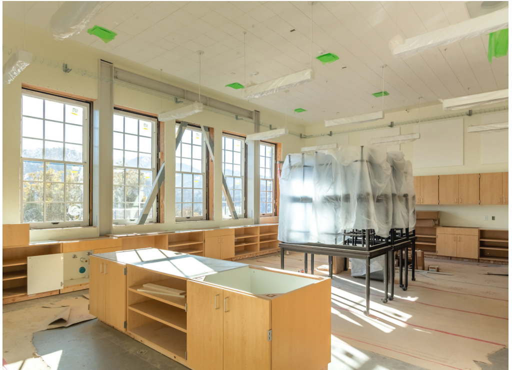
The Hanby Middle School 1910 Building remodel will allow full utilization of the 3rd floor and add five additional classrooms, including the updated Science classroom pictured here.

We invite you to stay informed about the progress of Hanby Middle School's 1910 Building by visiting our bond website at: