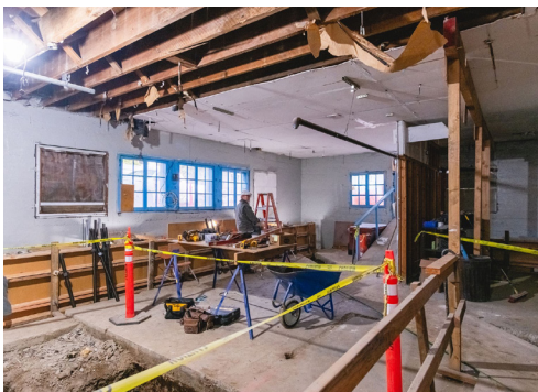
Demolition work on the historic building began in January 2022.